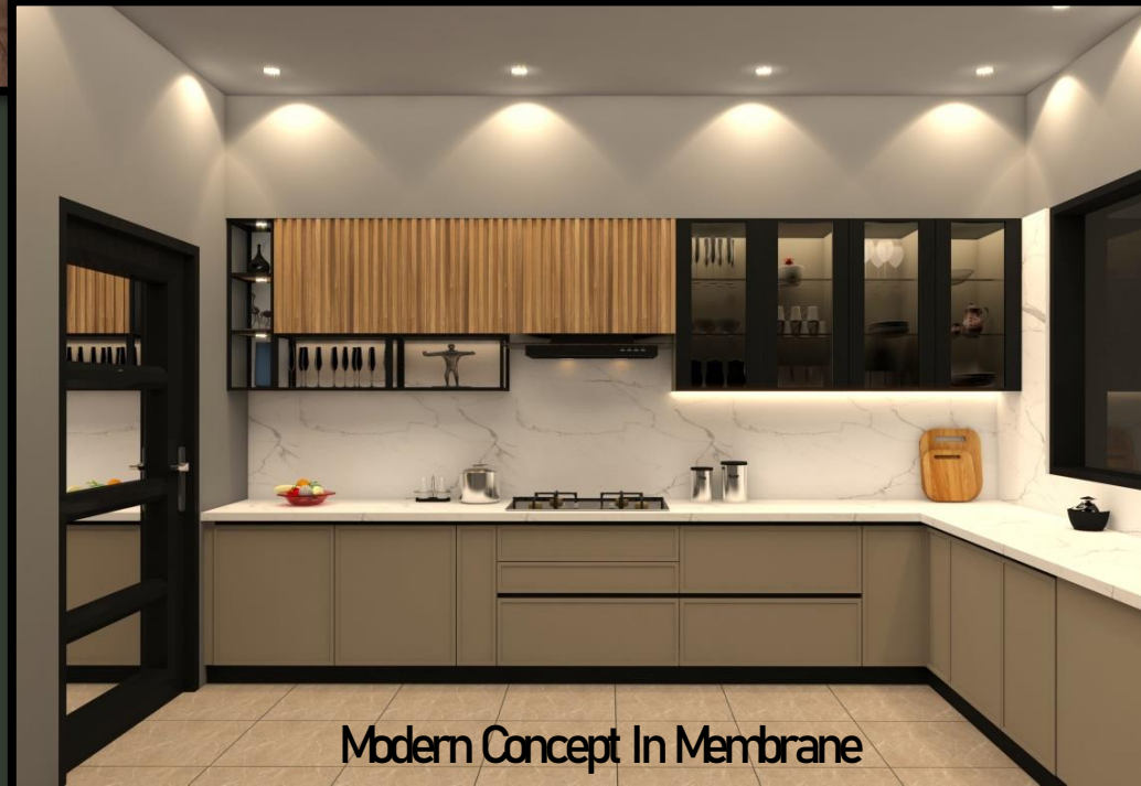
Modern Concept In Membrane

BASE MATERIAL : Supertuff HDF SEAMLESS I EDGELESS : Single Piece shutters with soft edges. High gloss / wood print foil pressed on German Membrane press with special adhesives gives perfectly finished shutter.