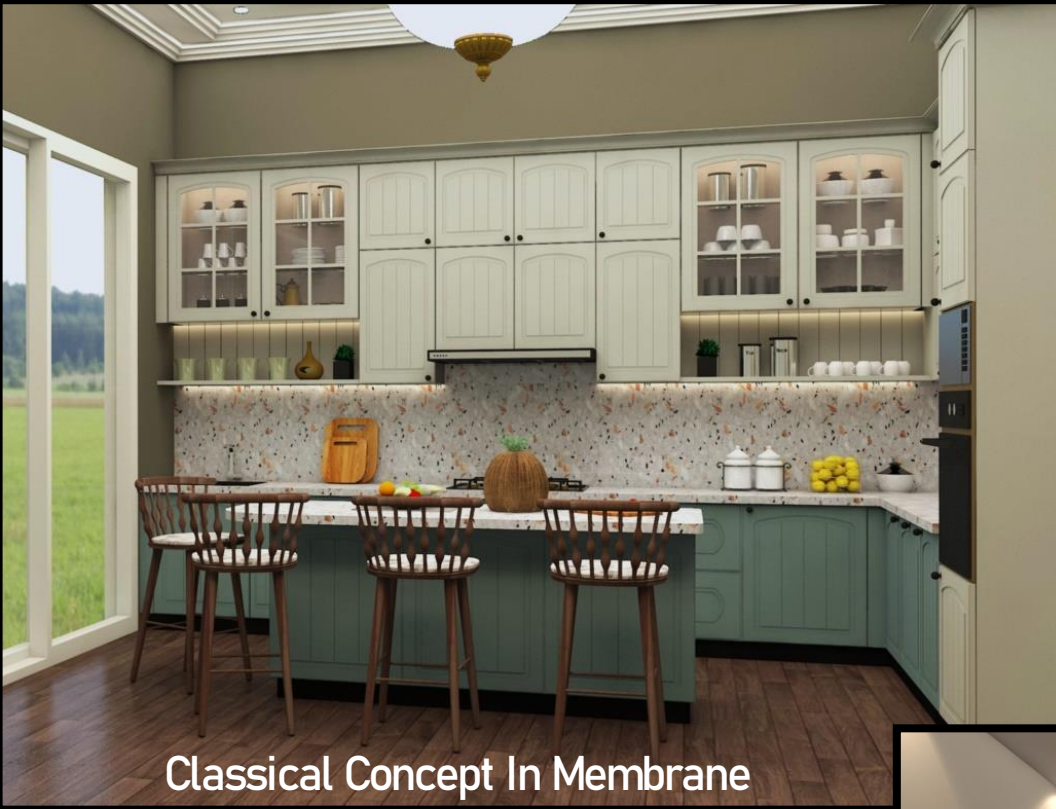
Classical Concept In Membrane

We offer a wide variety of shutters materials